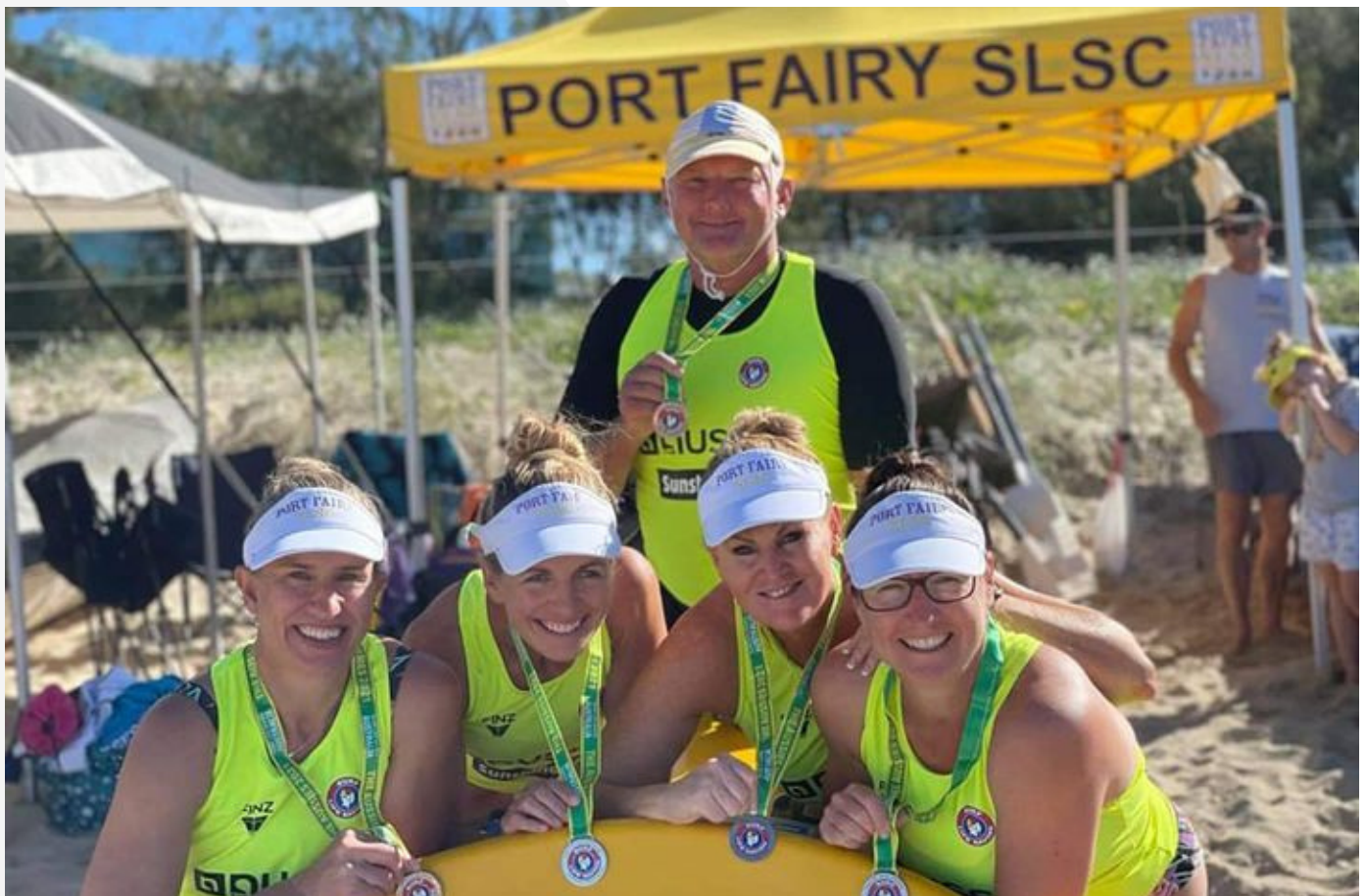
Firebirds Crew - Silver Medallists Australian Surf Lifesaving Championships - April 2021