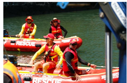
New year's day duck derby – a major fund raiser