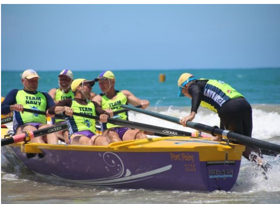
Shearwaters men's boat crew