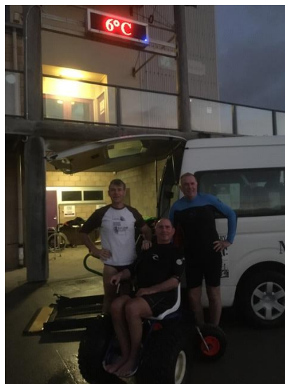
Early morning swimmers