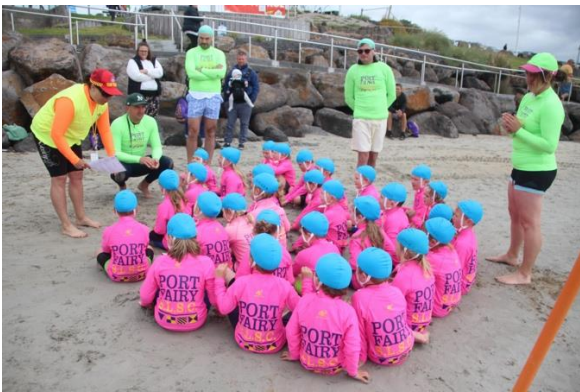
Under 13s - paying attention!