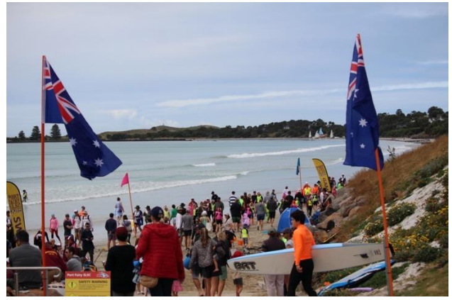
Australia day carnival 2020