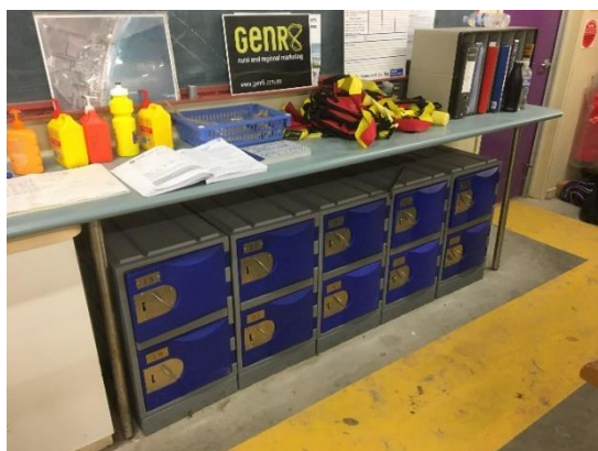
New lockers under the patrol desk