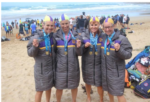
Firebirds with their gold medals