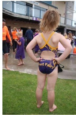
Club apparel – rear views