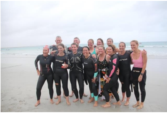
Moyneyana ocean swim