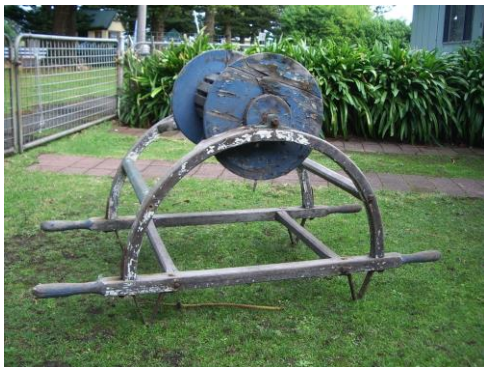
Reel prior to restoration, circa 2019