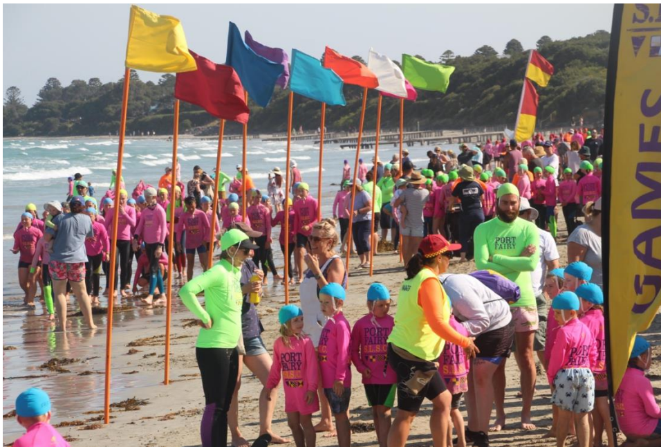
Nippers lined up ready to go