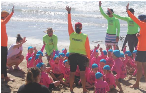
Under 6: Boys and Girls