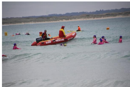
IRB patrolling the under 10s board race