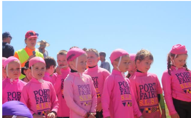
Under 7: Boys and Girls