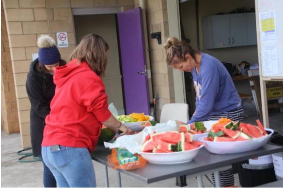
Willing volunteers preparing snacks for the Nippers