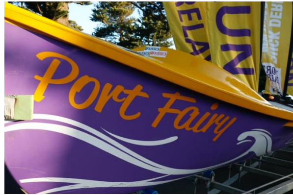
New year's eve street parade