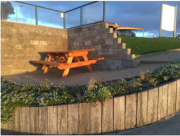
New picnic table and landscaping