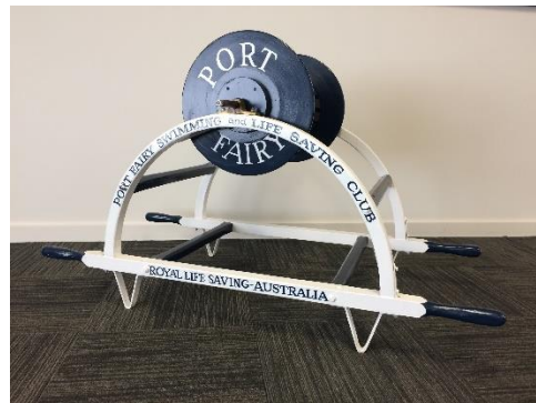
After restoration – June 2020