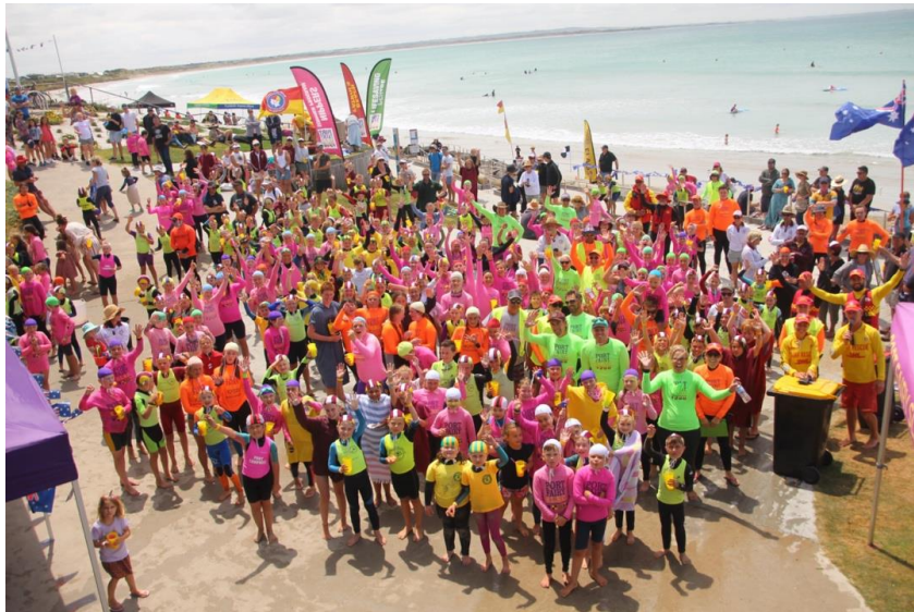
Nippers gathered in front of the clubhouse for the Australia day carnival