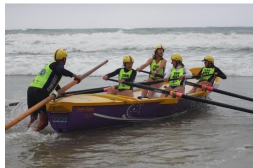
Firebirds women's boat crew