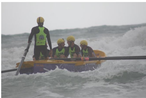
Shearwaters men's crew