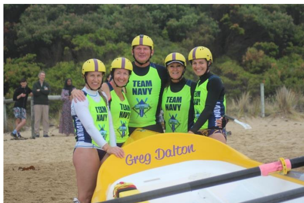
Firebirds women's boat crew