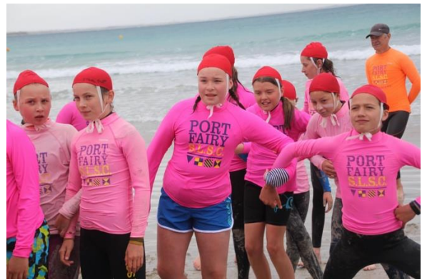
Under 12s – ready to go