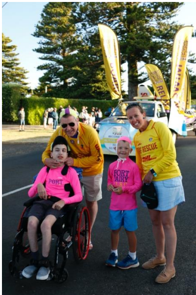
New year's eve street parade