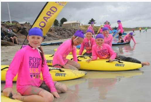
Under 10s – with their Nipper boards