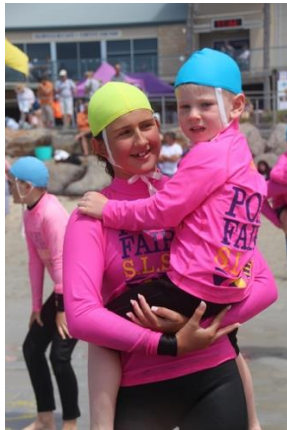
Under 9 – receiving special care