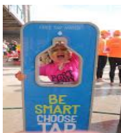
Wannon Water water stand. Australia Day