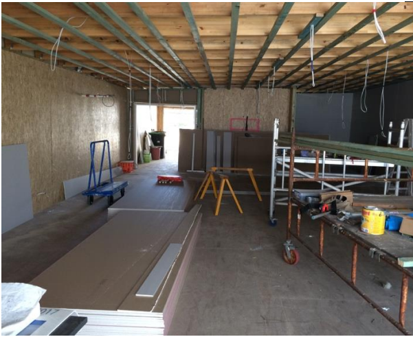
Inside looking towards the entrance