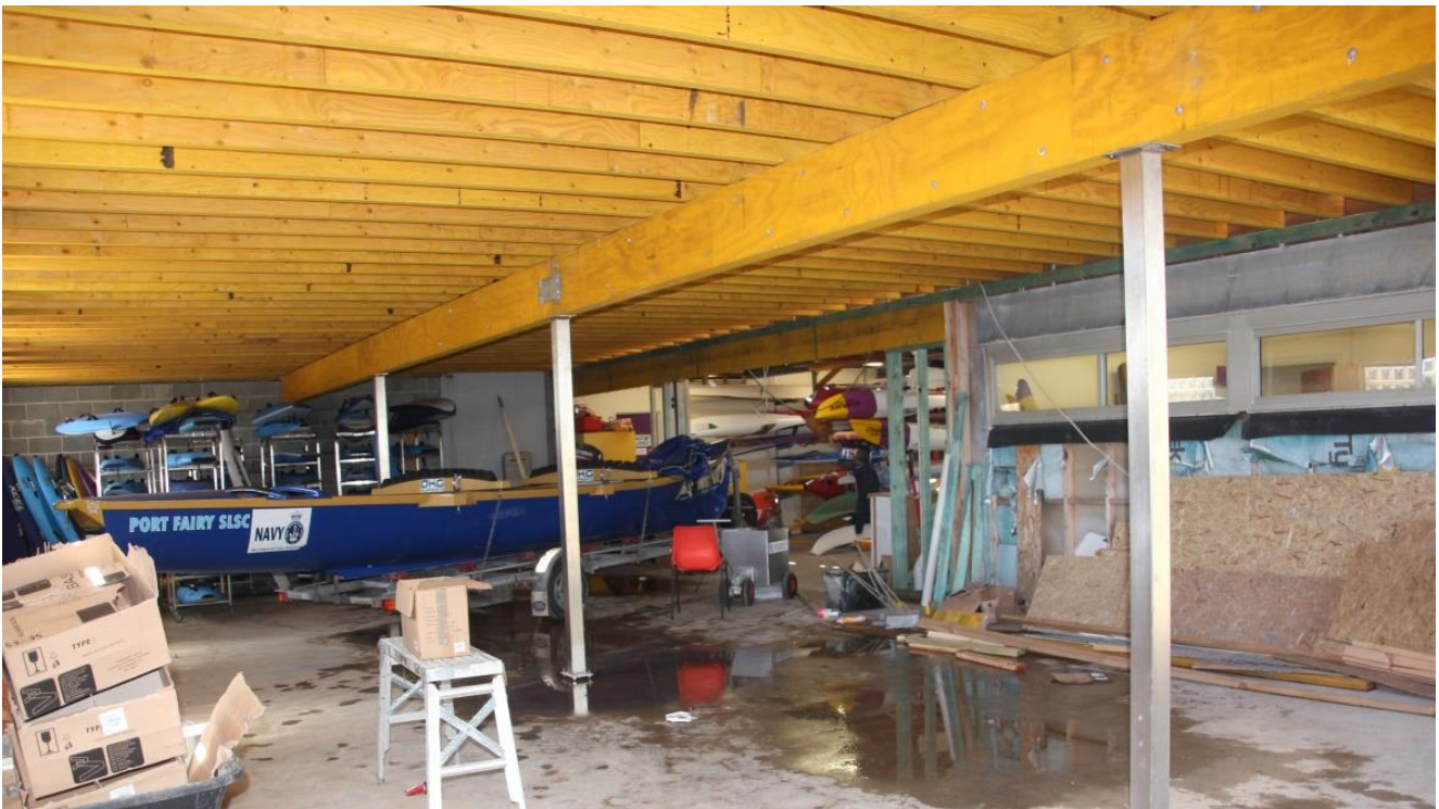
August 2017 – now there is more room for life saving equipment downstairs