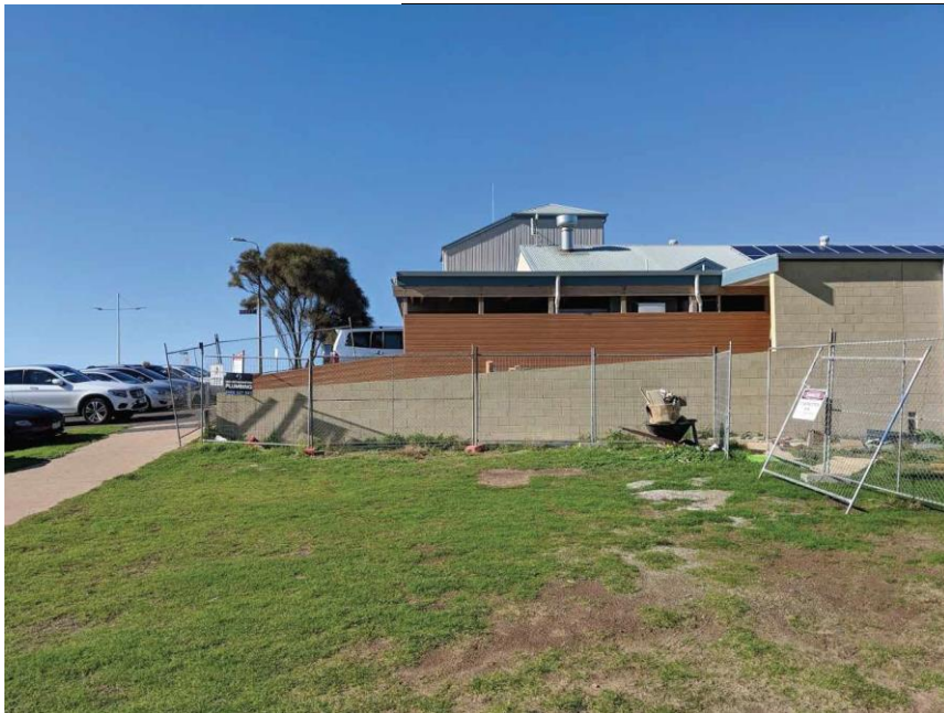
View from the lower end of Hughes Avenue