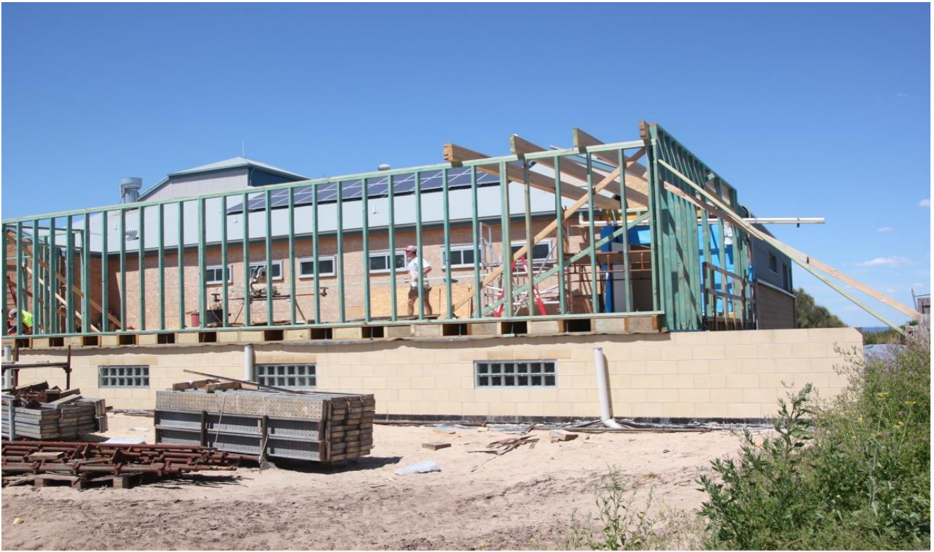
August 2017 – the frame is up and ready for roofing