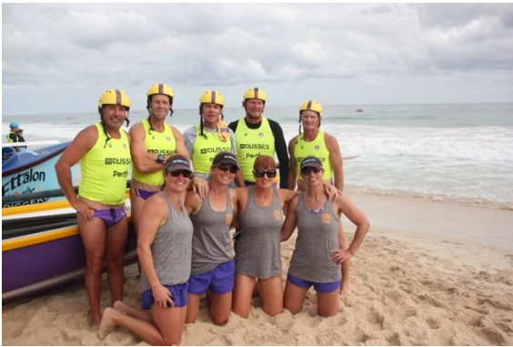
Shearwaters and Firebirds at Scarborough