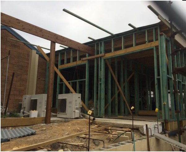
Front entrance and office