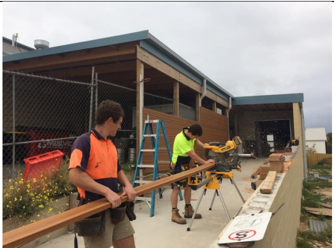
Working on the entrance wall