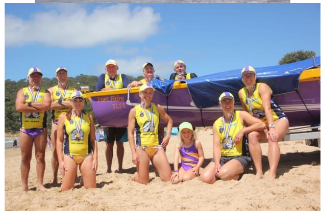
Shearwaters and Firebirds, Gold medallists, Vic Masters at Lorne beach