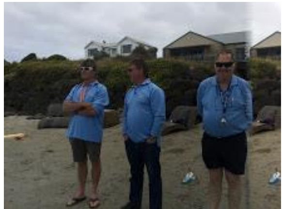
Duck Derby New Year's Day 2018 Our Assessors