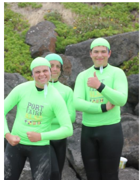
Nippers 2017 - 2018